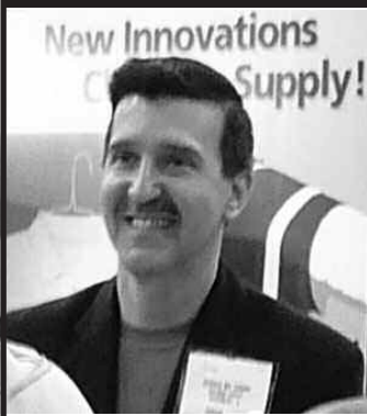
BY DENNIS MCCRORY

The most powerful marketing strategy is also the most obvious. It's simple and easy to understand. That's why it works so well.